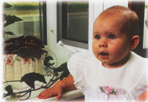
Easy to clean...Easy to Maintain