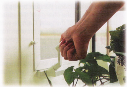
Easy turn vents for cross ventilation